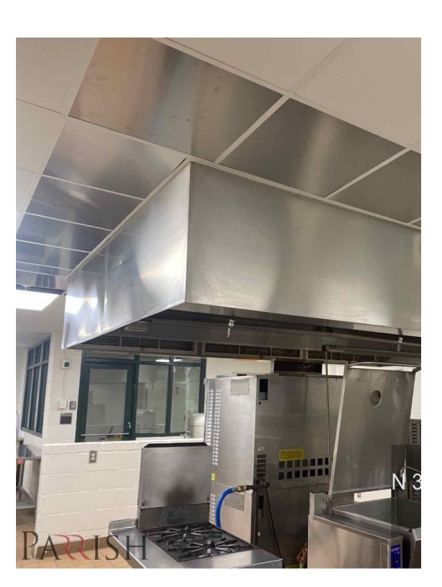
Metal ceiling tile installation